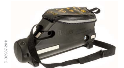
Dräger Saver CF – hard case