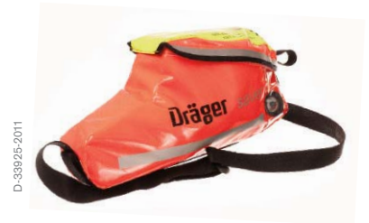
Dräger Saver CF – soft bag

The SE version includes a newly developed elastic neck seal which offers unparalleled resistance to the effects of high temperatures, ozone and diesel fumes, which are often found in places such as engine rooms. This translates to years of reliable, worry-free service, even under adverse conditions. Standard Dräger Saver CF15 units can also be retrofitted with the SE option.