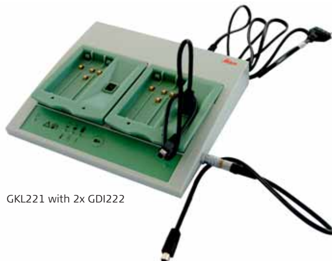
GKL221 with 2x GDI222

The microprocessor controlled charging station recognises the type of battery connected and derives the charging parameters such as time and current. The batteries are optimally and appropriately charged. This guarantees the maximum possible service life. The charging station can recognise and charge cells of the NiCd, NiMH and Li-Ion types. Up to five batteries can be connected to the charger simultaneously. Two batteries are charged at the same time and the rest are charged in the order they were connected.