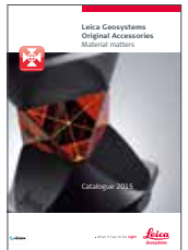
Leica Original Accessories