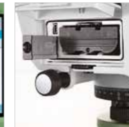
EASY DATA TRANSFER