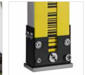
USE STANDARD INVAR STAFF