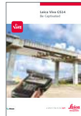
Leica Viva GS14