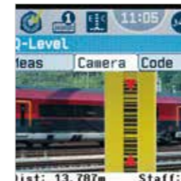
DIGITAL CAMERA AIMING