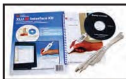
Computer Interface Kit - connects to any Windows™ application