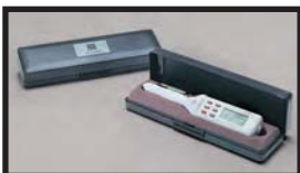
Hard Plastic Protective Case - protect your investment