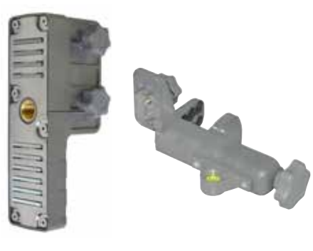
CR700 includes C71 Magnetic Clamp and C70 Rod Clamp